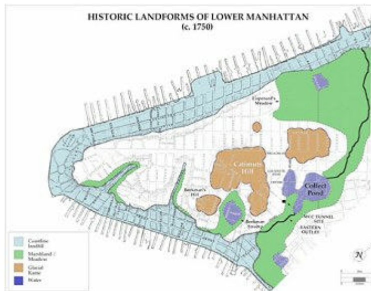
18th century landscape reconstruction of Lower Manhattan

Geoarcheology Research Associates, Inc. (GRA) , is a specialty firm dedicated to providing a broad range of cultural resources and archeological services to both public and private sector agencies. Our primary market is in the domestic development sector—governmental and private—where we apply earth science strategies to determine archeological sensitivity for preservation compliance. Our project areas span the continent and our clients include large CRM firms, as well as primary contracting agencies and development interests. Our secondary market is international, where we co-ordinate large-scale research and management projects in developing nations that are beginning to formulate heritage and conservation programs.